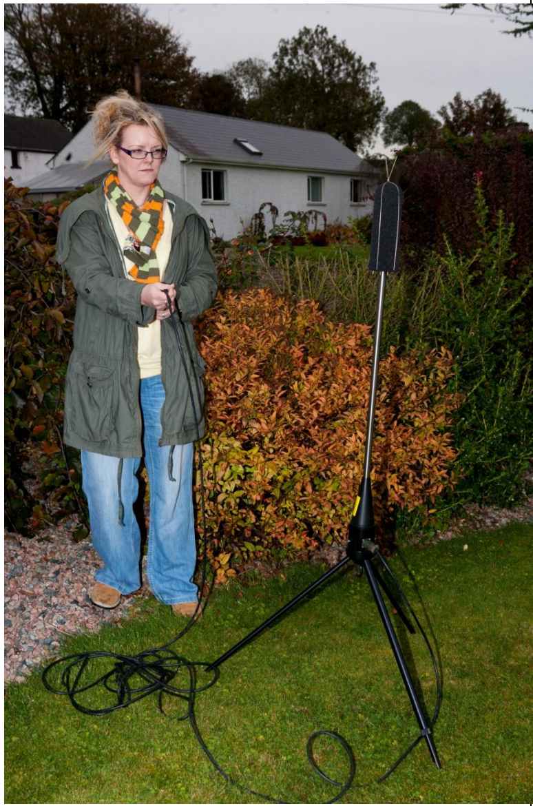
2.4 Quite day time L A 90 NML 1.